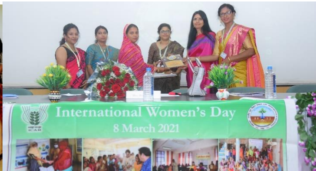
Felicitating successful women farmers by the Chief Guest