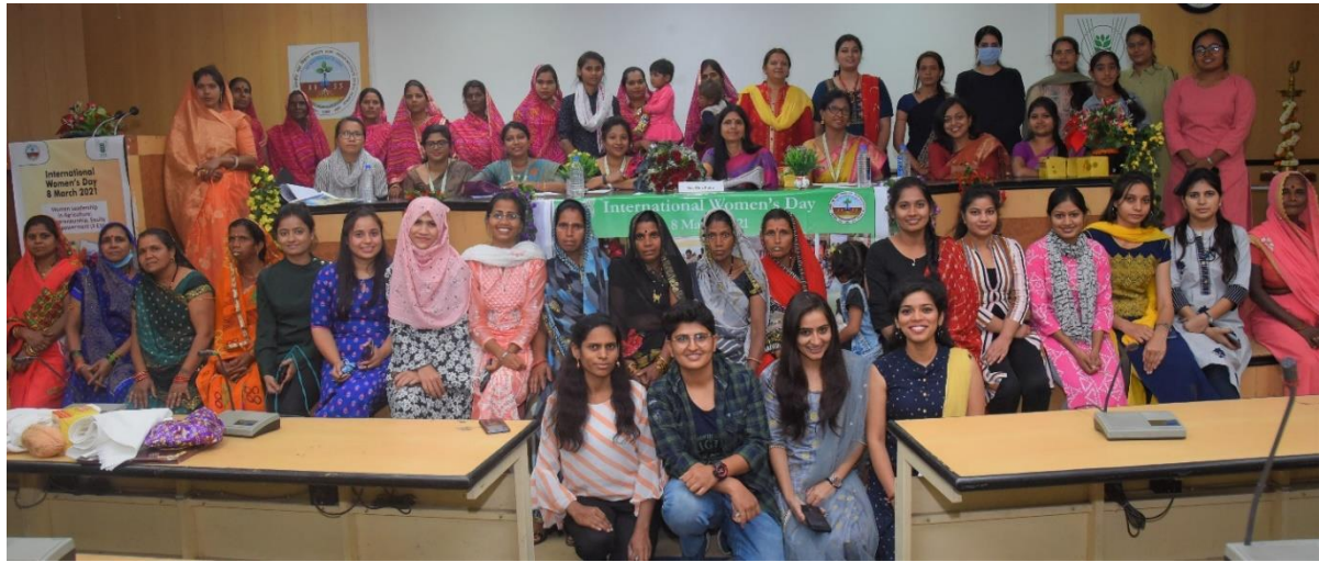
Women farmers and staff of the institute participated in the program