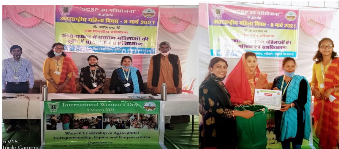
Distribution of family net vessel composting to women farmers