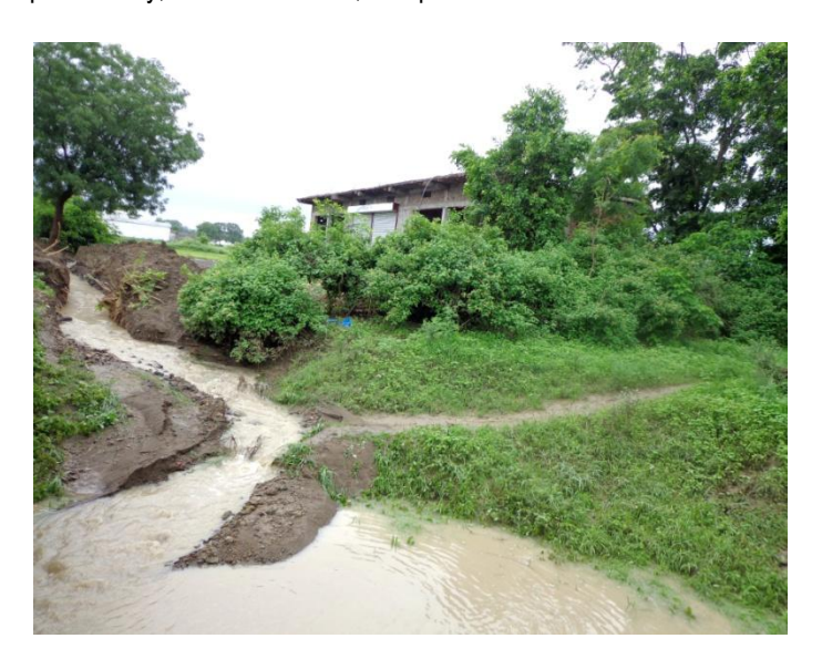
Figure 1 Surface runoff from the catchment area of Upper Lake, Bhopal

Normally, point sources refer to the discharges from industry and urban wastewater. Diffuse sources (non-point sources) include background losses, losses from agriculture, losses from scattered dwellings, and atmospheric deposition on water bodies. The rate at which phosphorus loads enter freshwater systems varies with land use, geology, morphology of the drainage basin, soil productivity, human activities, and pollution.