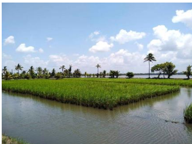
Figure 6: Rice crop ready for harvesting in Pokkali lands

Since rotational paddy-fish or prawn culture is a general practice in these fields; the farmers cut only the panicle along with a small portion of rice stem at the time of harvesting. After paddy harvest saline water flow starts again in to field in tidal action. Crop stubbles left unharvested in the field get decomposed in this water and that in turn activate algal growth. This creates ideal condition