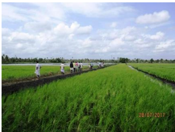
Figure 5: Rice crop after dismantling nursery beds in Pokkali lands

Both “Pokkali rice” and “Kaipad rice” have obtained Geographical Indications (GI) tag in the years 2007 and 2013 respectively.