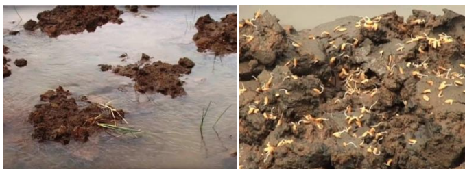
Figure 3: (a) Mounds ready for sowing (b) Spreading of germinated seeds on mounds in Kaipad lands