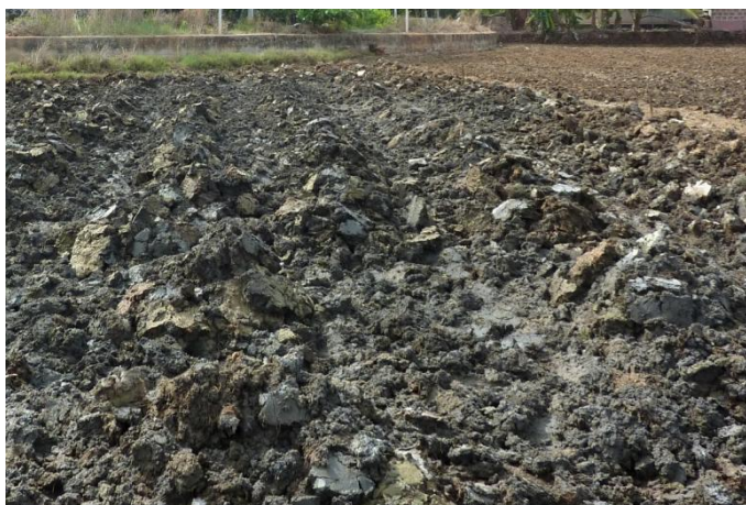
Figure 3(b) Soil mounds prepared before monsoon in Kaipad lands