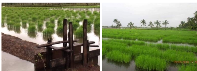
Figure 4: Paddy nurseries (a) Kaipad land (b) Pokkali land

Generally manuring and intercultural operations are not practiced for the paddy crop in these special rice growing tracts.