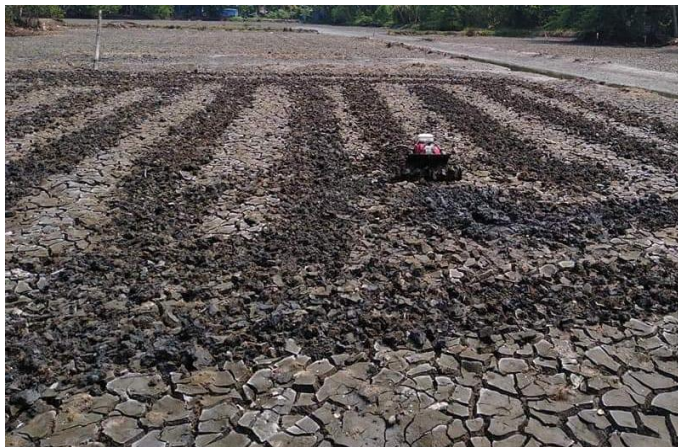
Figure 2(a) Land preparation in Pokkali lands

firmly in the soil. Crowding of seedlings used to be managed through simultaneous spreading by women labourers (figure 5).