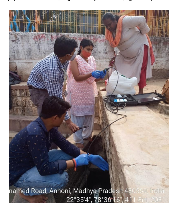
Figure 3: Water sample collection from Anhoni hot spring locate in the Chhindwara district of Madhya Pradesh (India)

Although there is a large body of literature available about microbial diversity studies in hot springs, only a few studies focused on Indian hot springs and their microbial diversity analysis. Researchers of ICAR - Indian Institute of Soil Science, Bhopal are also working to explore the agriculturally important microbial population from hot springs of Madhya Pradesh (Figure 2&3).