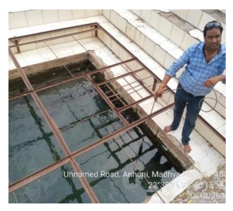
Figure 2: Anhoni hot spring located in the Chhindwara district of Madhya Pradesh (India)

In India, HS are not found on the basis of volcanic activity but are formed due to orogenic activity and convectional circulation of the heat from one layer of the earth crust to another layer which make it warm due to uneven temperature of the both layers of the earth. Geotechnologists have divided the Indian hot water springs based on tectonic trends, continental rifts and plate margins into (1) NW-SE Himalayan arc system with continuation to Andaman Nicobar Island, (2) Son-Narmada-Tapti, (3) West Coast Continental margins, (4) Parts of Gondwana-Grabens, (5) Regions of Delhi folding. In India, Hot Springs present in many states (Table 1, Figure 2).