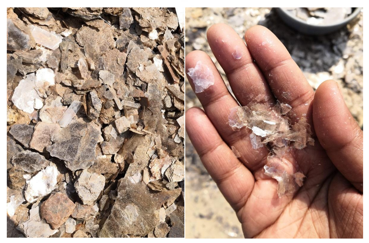
Figure 1. Mica blocks (left) and mica flakes (right) obtained from mica mining areas of Jharkhand